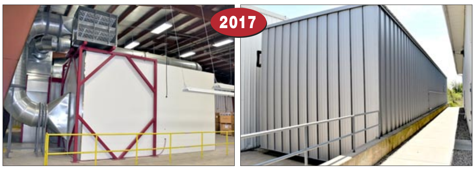
EXTERIOR VIEWS OF 2017 GLOBAL FINISHING SOLUTIONS ENTIRE CONTINUOUS PAINT SYSTEM