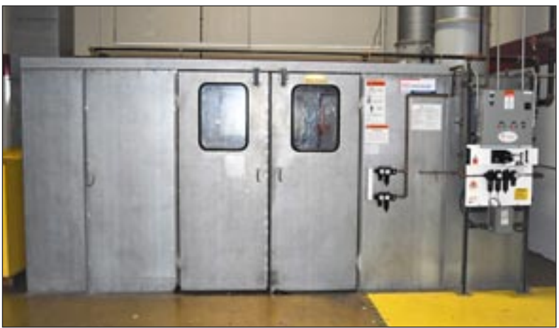
GLOBAL FINISHING SOLUTIONS FAST-PAK SIDE DRAFT DRIVE IN PAINT BOOTH