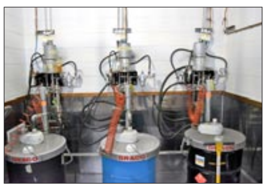
GRACO PROMIX EASY PROPORTIONER