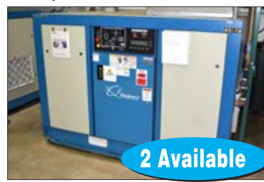
QUINCY 50-HP ROTARY SCREW AIR COMPRESSORS

• (2) Quincy 50-HP QSI-245 ACA31EE Rotary Screw Air Compressors