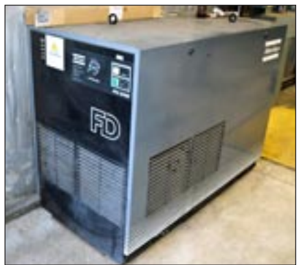
ATLAS COPCO FD345 AIR DRYER