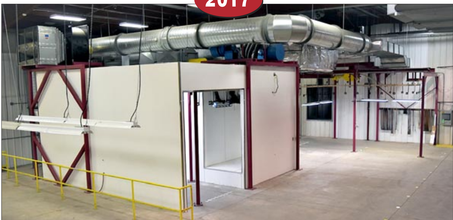
EXTERIOR VIEWS OF 2017 GLOBAL FINISHING SOLUTIONS ENTIRE CONTINUOUS PAINT SYSTEM