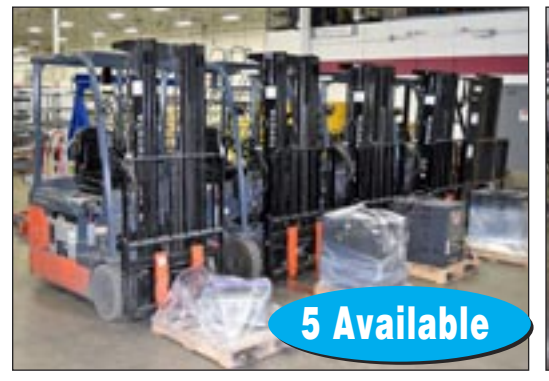
TOYOTA 3,000-LBS. CAP.ELECTRIC FORKLIFT TRUCKS