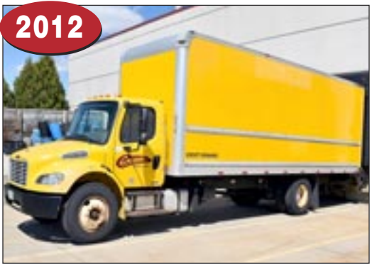
FREIGHTLINER BOX TRUCK

• 2012 Freightliner 26-Ft. S/A Box Truck • 1998 Dodge Ram Pickup Truck