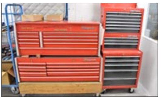
VIEW OF TOOL CABINETS