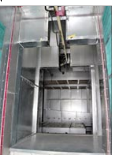
INTERIOR VIEWS OF 2017 GLOBAL FINISHING SOLUTIONS ENTIRE CONTINUOUS PAINT SYSTEM