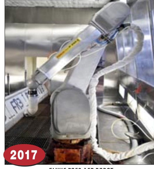
FANUC P250-15P ROBOT