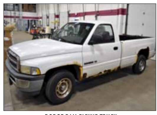
DODGE RAM PICKUP TRUCK