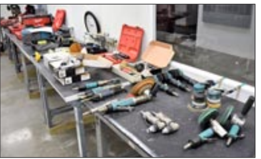
VIEW OF POWER TOOLS