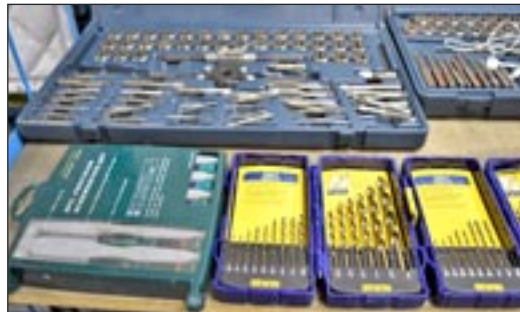
VIEW OF TOOLING AND DRILL BITS