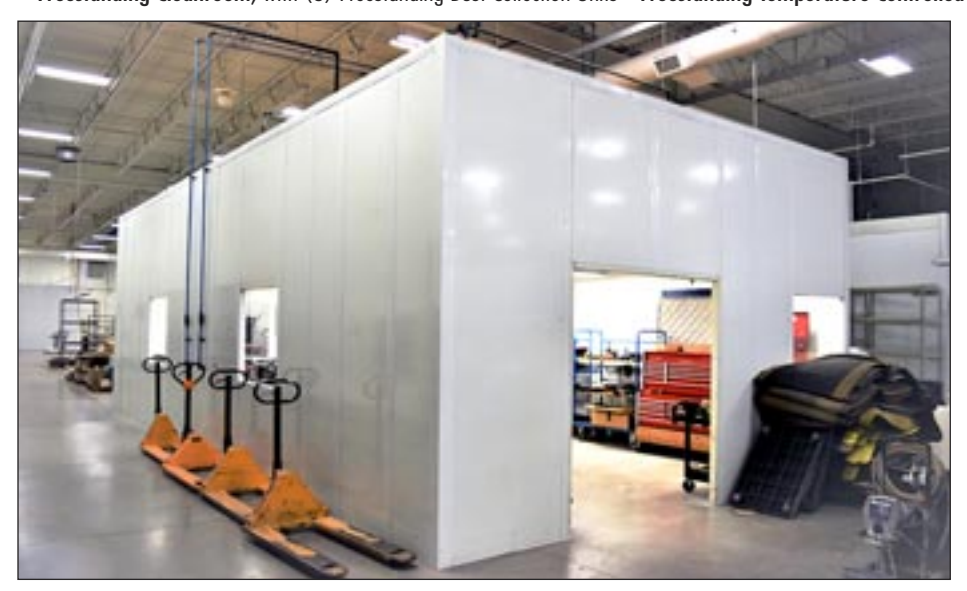
FREESTANDING TEMPERATURE CONTROLLED CLEANROOM

• Freestanding Cleanroom, with (3) Freestanding Dust Collection Units • Freestanding Temperature Controlled Cleanroom, with (1) Standard Locking Door