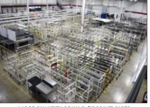
LARGE QUANTITY OF W.I.P./PRODUCT CARTS