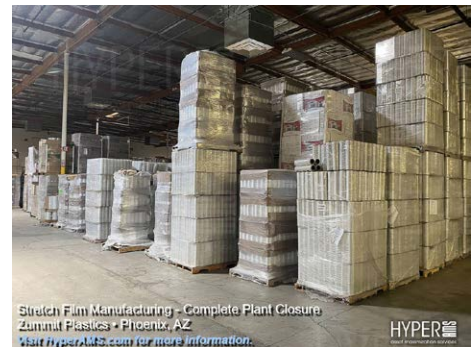
Over 1 million pounds of Scrap Plastic, Virgin Resin, and Regrind

Zummit Plastics 240 N 48th Ave. Phoenix, AZ 85043