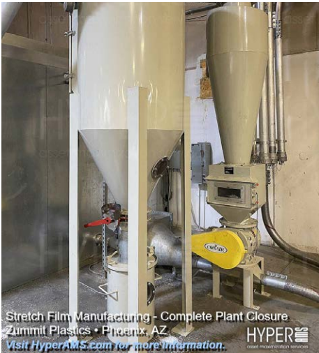
Conair Railcar Unload System