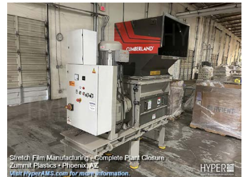
Cumberland EBS 850 Shredder (2012)

Zummit Plastics 240 N 48th Ave. Phoenix, AZ 85043