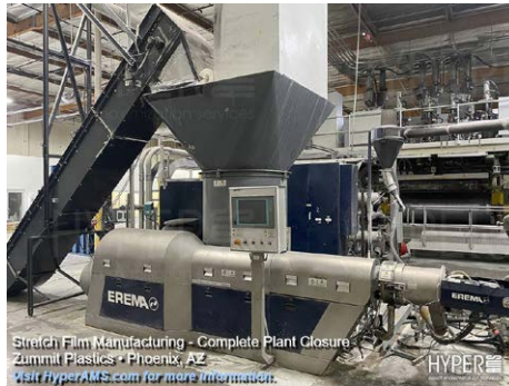
EREMA Intarema 1108T Recycling Pelletizing Line (2017)