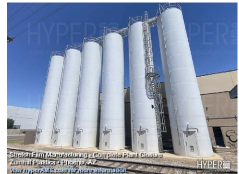
(6) CST STORAGE Plastic Resin Silos, 6,660 CU FT Capacity (2017)