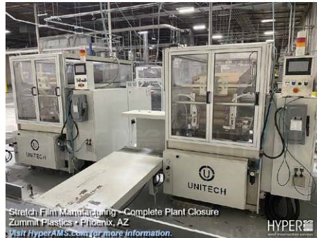
(4) 2019 & 2018 Unitech T012 & T012-FX5U Rewinders