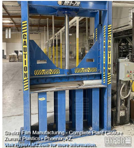
REI-ZR Guillotine Shear