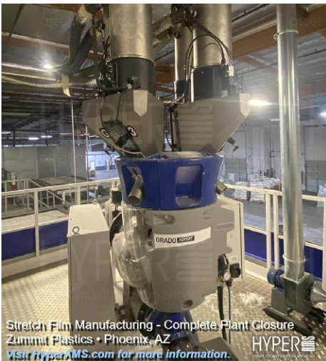
(11) Doteco Gardo Gravimetric Batch Blenders