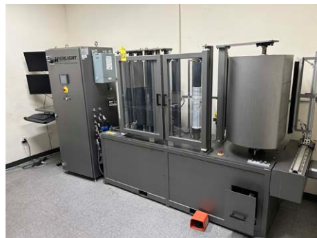
Highlight Industries Plastic Film Tester