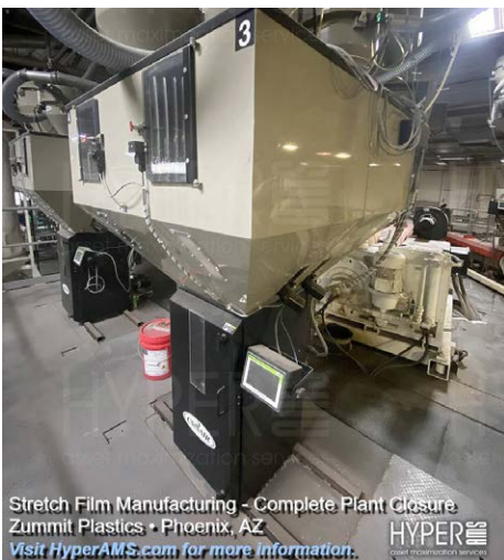
Conair TB900 Trueblend Gravimetric Batch Blenders