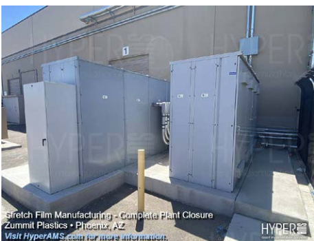
(2) Siemens Switchgear Units