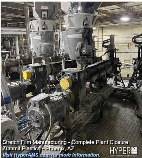
(11) DOTEKO Gardo Gravimetric Batch Blenders