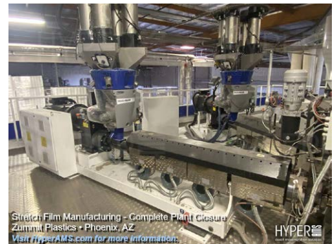
Colines ESTR Perform EX 120, 80 & 65 mm Extruders