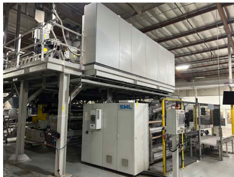
SML W3000 Cast StreTch Film Line (2017)