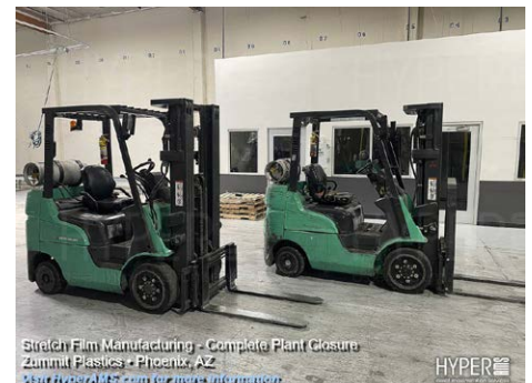
(2) Mitsubishi 5,000 lb cap. Forklifts

Zummit Plastics 240 N 48th Ave. Phoenix, AZ 85043