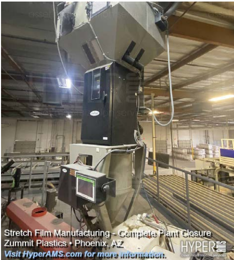
Conair TB25-4 Trueblend Gravimetric Batch Blender