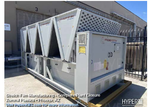
(2) FrigoSystems 225-Ton Chillers