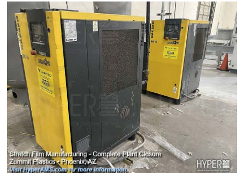
(2) Kaeser SK 15, 15HP Compressors