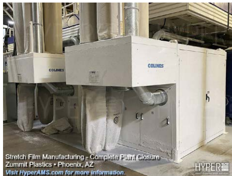
(2) Rimor 3000 Suction and Granulating Systems