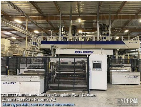
COLINES ALL roll EX 3000 Cast StreTch Film Line (2022)